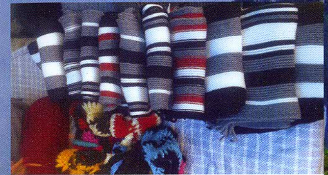
Hand made Woollen Winter Muffler