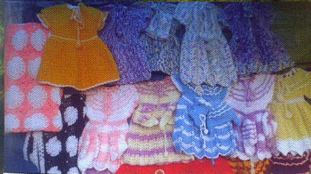
Hand made Woollen Baby Frock