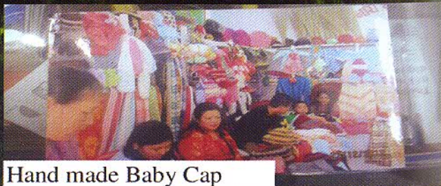
Hand made Baby Cap

The women entrepreneurs manufacture woollen garments by hand knitting and later on using semi automatic machines. It has become the major earning source for house hold women entrepreneurs and has helped in solving the unemployment in Darjeeling District of West Bengal. Their main market is Darjeeling town mostly on the side of Chowrasta mall and regular knitting has order supply basis business with garment shops. These enterprises are Micro households unit located in around the village of Darjeeling. The entrepreneurs having semi education has develop pattern and design on their own capacity. They work in unorganized way with availability of low quality raw material from local traders causes many hurdle in rapid improvement of their work in term of quality and quantity as well.